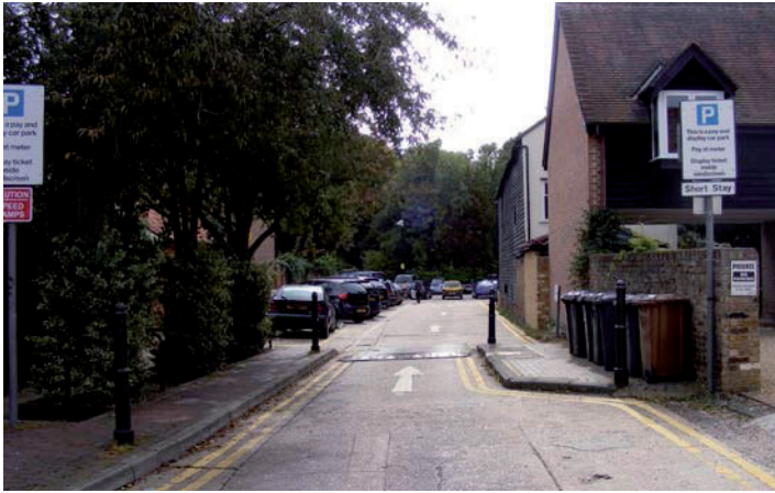
St Andrews Street Car Park

These public car parks are shown on the general map.