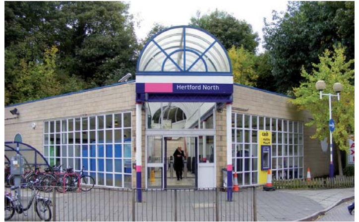
Hertford North Railway Station