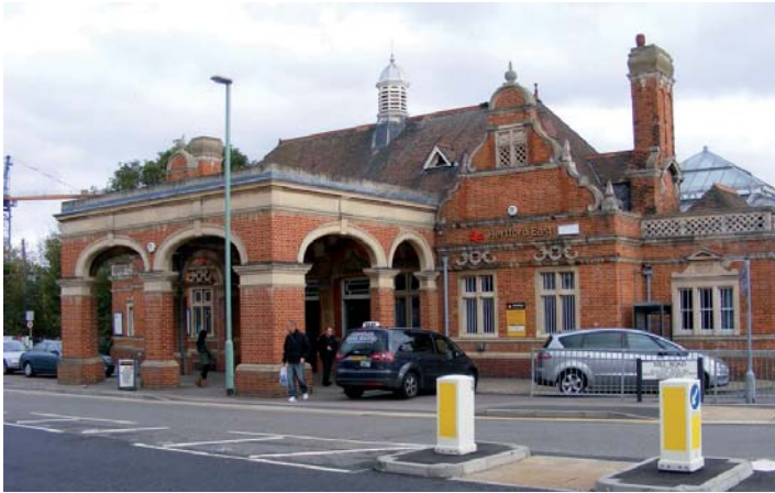
Hertford East Railway Station

Walking directions from both Hertford Railway Stations are shown on the general map on page 1.