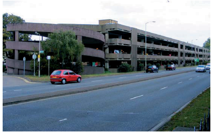
Gascoyne Way Multi-story