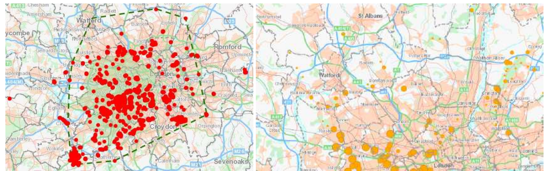
OPM nests recorded in 2017 (dots) and 2016 OPM pheromone trap results for 2017 (male moths only) – (dotted line shows extent of nest distribution). size of circle relates to number of moths caught).