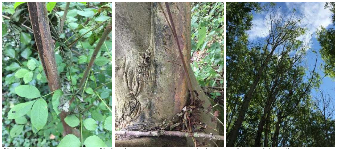
Chalara in young tree - stem Chalara in mature trees - stem lesion on main stem (photo 1) lesion and wilting leaves. and extensive dieback (50-75%) in ash tree crowns (photo 2).

Gemma Worswick, Weston Hills Local Nature Reserve nr Baldock, North Hertfordshire, 14 Sept 2017