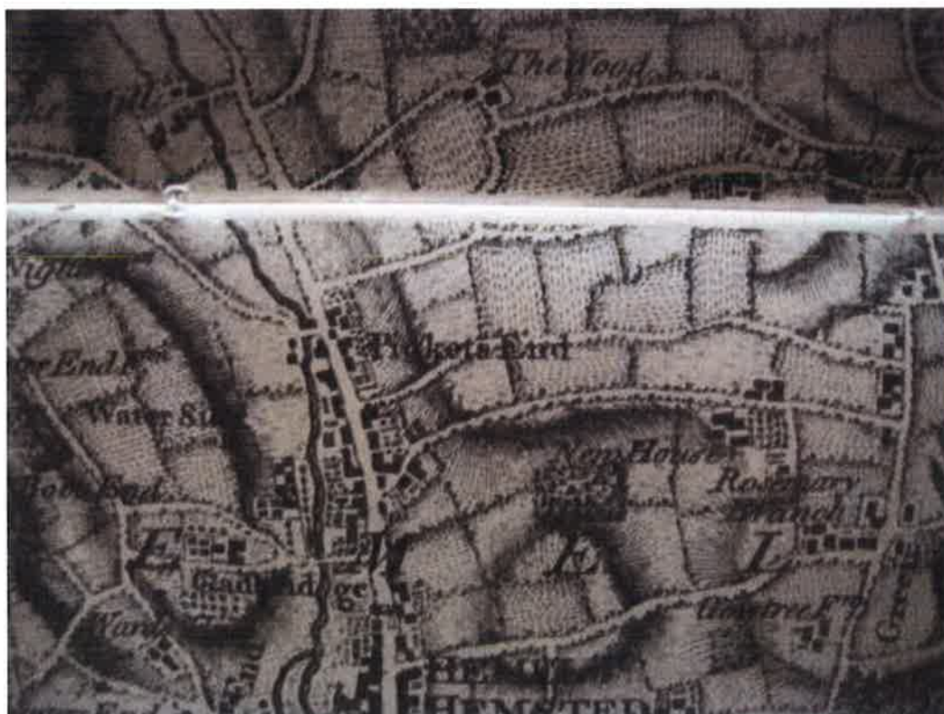
Extract from Dury and Andrews' Map (1766) showing the application route.