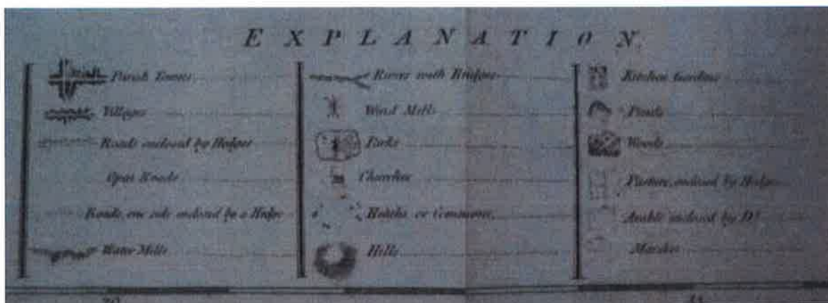
Extract from Dury and Andrews' Map (1766) showing the Key.