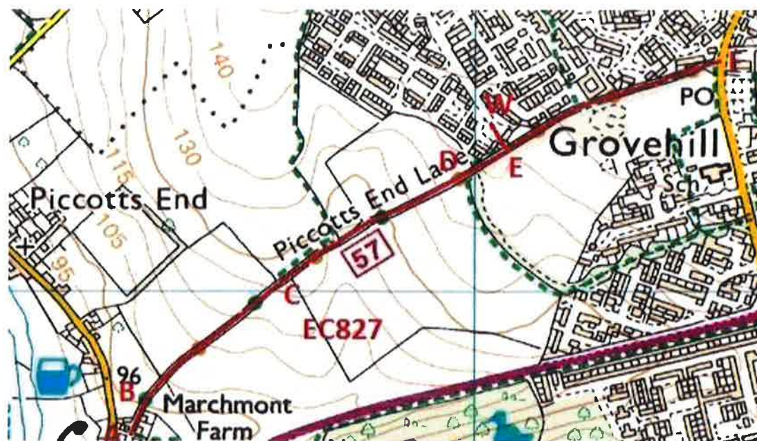
Ordnance Survey 1:25000 scale map extract showing application route