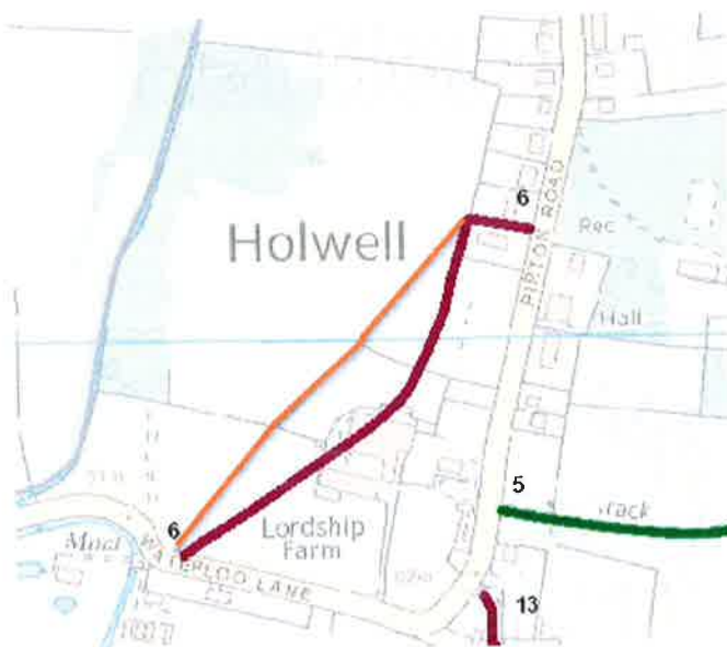
Figure 3 Corrected route of Holwell 6FP

The route of Holwell 6FP is on the wrong line on the 2010 Definitive Map. It has never existed along this route during the Flint's ownership of Lordship Farm dating back to 1919. It should align with the established route through the meadow in a north easterly direction along the north-western edge of the timber post and rail fence which demarcates the established field boundary. This route is shown in orange on the drawing reproduced at Figure 3 below.