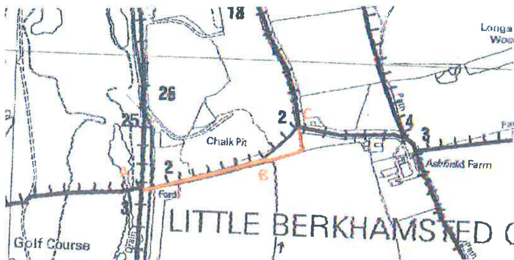
Extract of 2005 Definitive Map marked to show application route

2. The application route runs from Essendon 25 (a bridleway on the definitive map and statement) to Little Berkhamstead 18 (a bridleway on the definitive map and statement). Part of the application route is not currently shown on the definitive map of rights of way for Hertfordshire while the rest is shown as Little Berkhamstead 2 FP. It is shown on the plan below from point A (junction with Essendon 25) to B (point at which route leaves Little Berkhamstead 2) to C (junction with Little Berkhamstead 2).