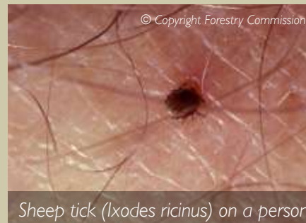
Sheep tick ( Ixodes ricinus ) on a person

Whilst Hertfordshire is not regarded as a high risk area, cases of Lyme disease have been reported throughout the UK. Readers of CMS News naturally have a close affiliation with the countryside and are regular users of it and as such, should be well informed on symptoms