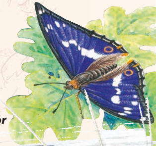
Purple Emperor butterfly