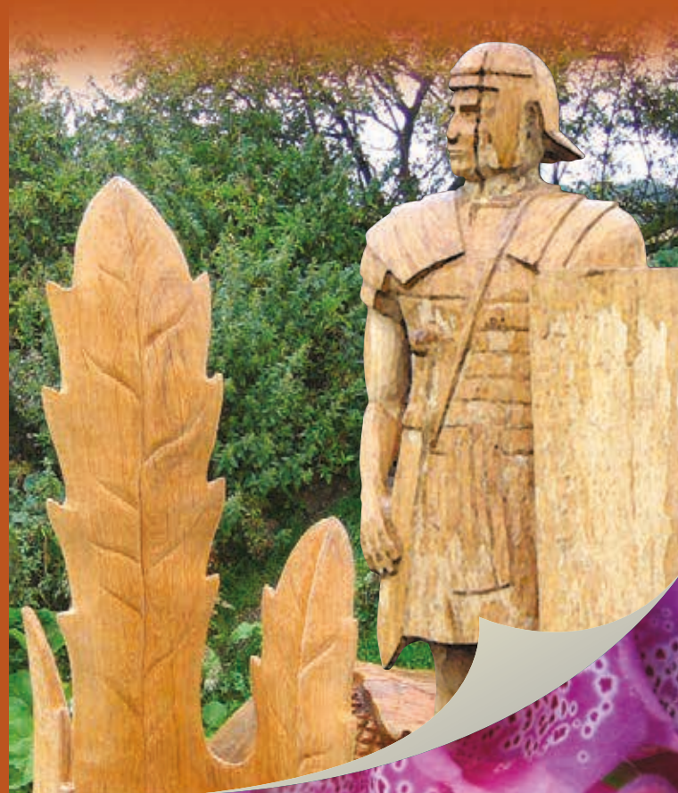
Produced by Fitzpatrick Woolmer Design 01634 711 771