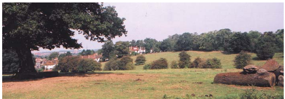
Haydon Hill Parkland